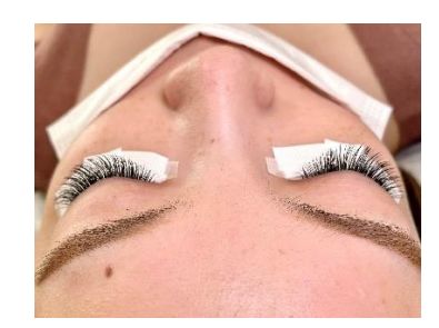
6 Eyes Closed After